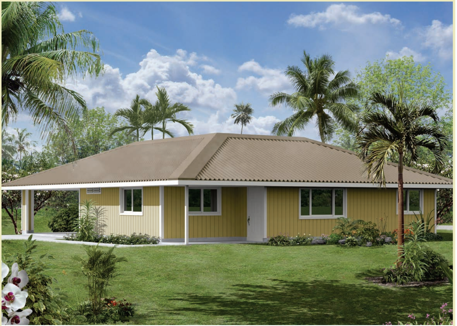
THE 'OHANA Illustration ©2008 Honsador LLC